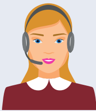
AIR TRAFFIC CONTROLLER