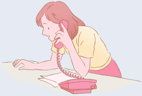
FLIGHT SERVICE SPECIALIST